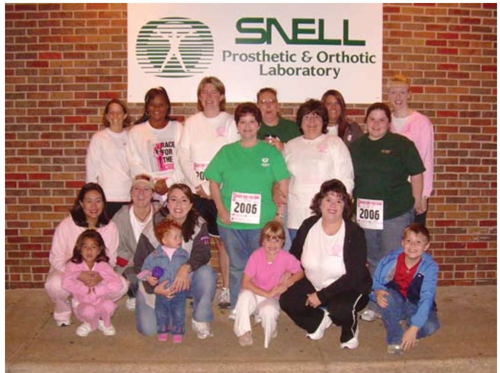
Snell staff and family members gather to participate in the The Susan G. Komen Race for the Cure. Snell Laboratory was a proud sponsor.