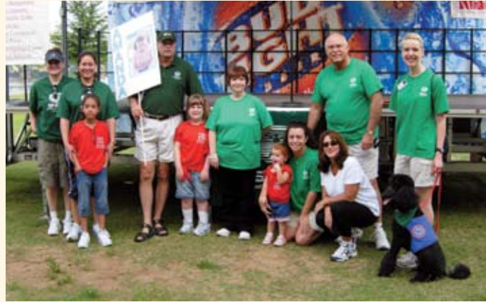
Snell employees at Easter Seals' Rollin' on the River event