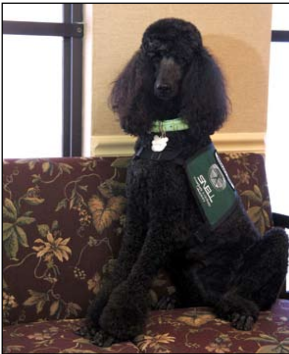
Visitors to Snell Laboratory are often greeted by the company's "therapy-poodle", UCD Theodore Black Forest Bear, CD, RE, CGC, TDI, W-FD/MF. Affectionately known as Teddy, his credentials include certified therapy dog.

Snell Laboratory patients, colleagues, and referrals are invited to call and schedule a tour of the transformed facility.